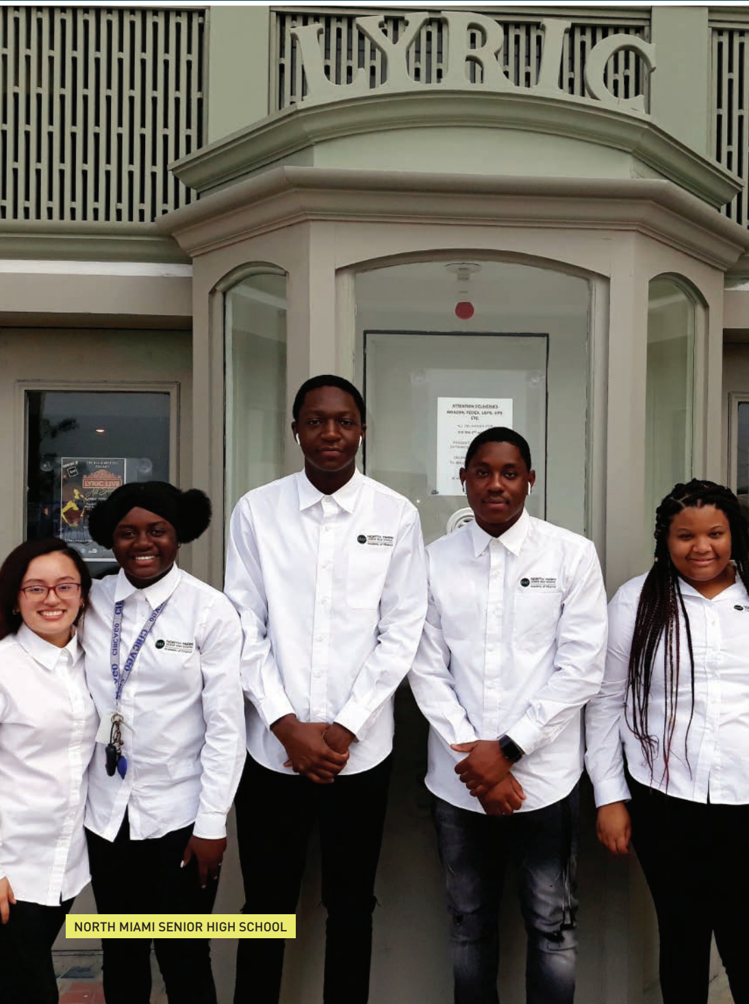
NORTH MIAMI SENIOR HIGH SCHOOL

“THE KEY, TO BEING SUCCESSFUL IN ANY ENDEAVOR, IS DOING YOUR BEST AND PUSHING OTHERS TO DO THEIR BEST. DON'T SETTLE FOR MEDIOCRITY.”