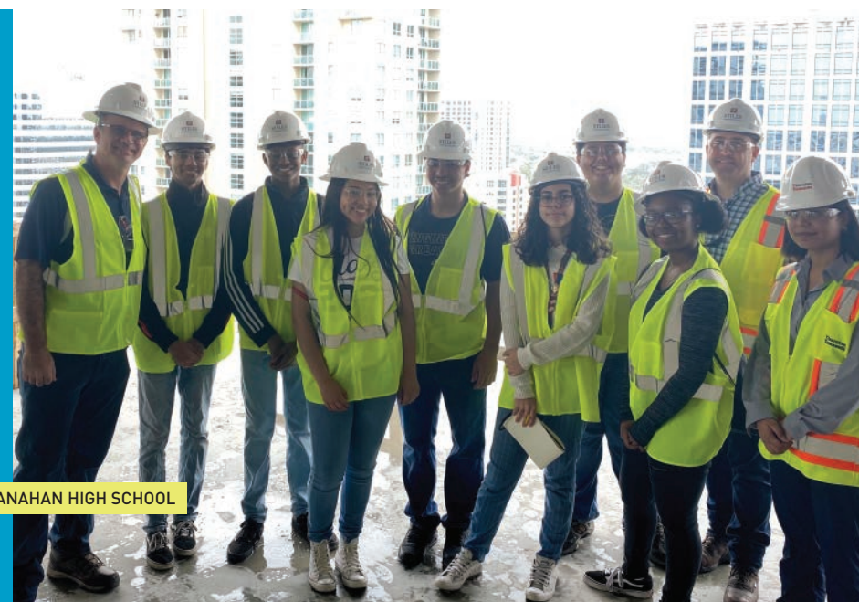
STRANAHAN HIGH SCHOOL

BEST PRACTICE: Our program emphasizes the importance of intertwining practical skills, creativity, and knowledge.