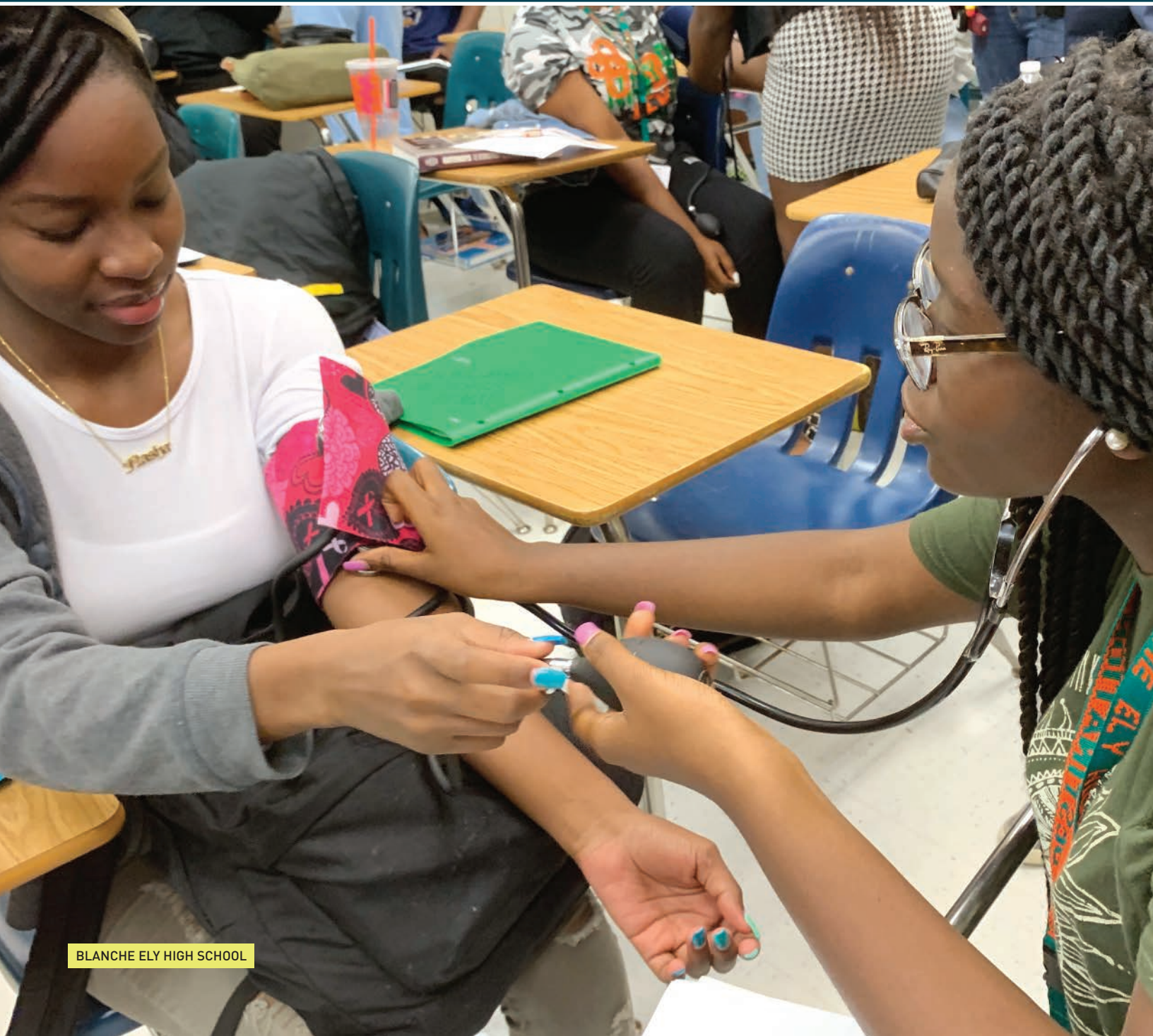
BLANCHE ELY HIGH SCHOOL