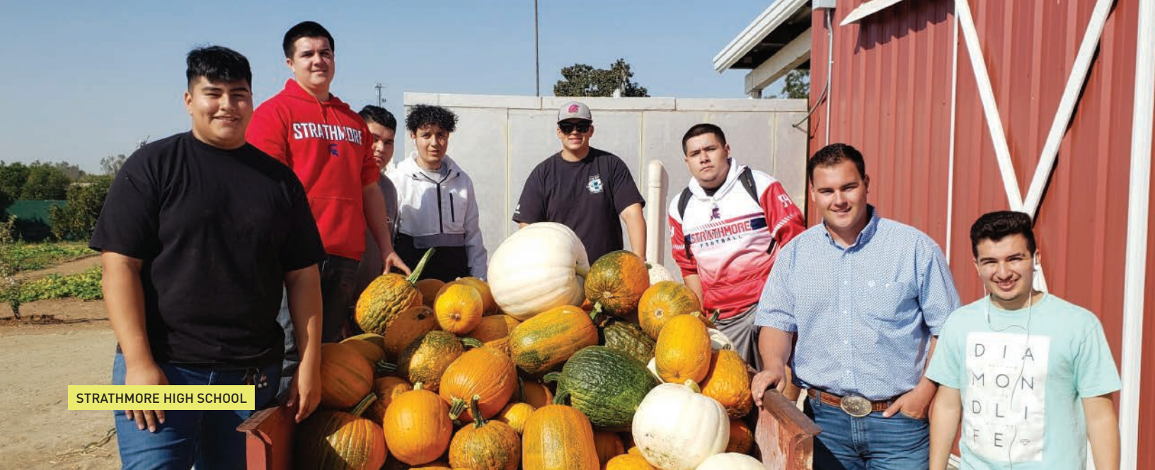
STRATHMORE HIGH SCHOOL