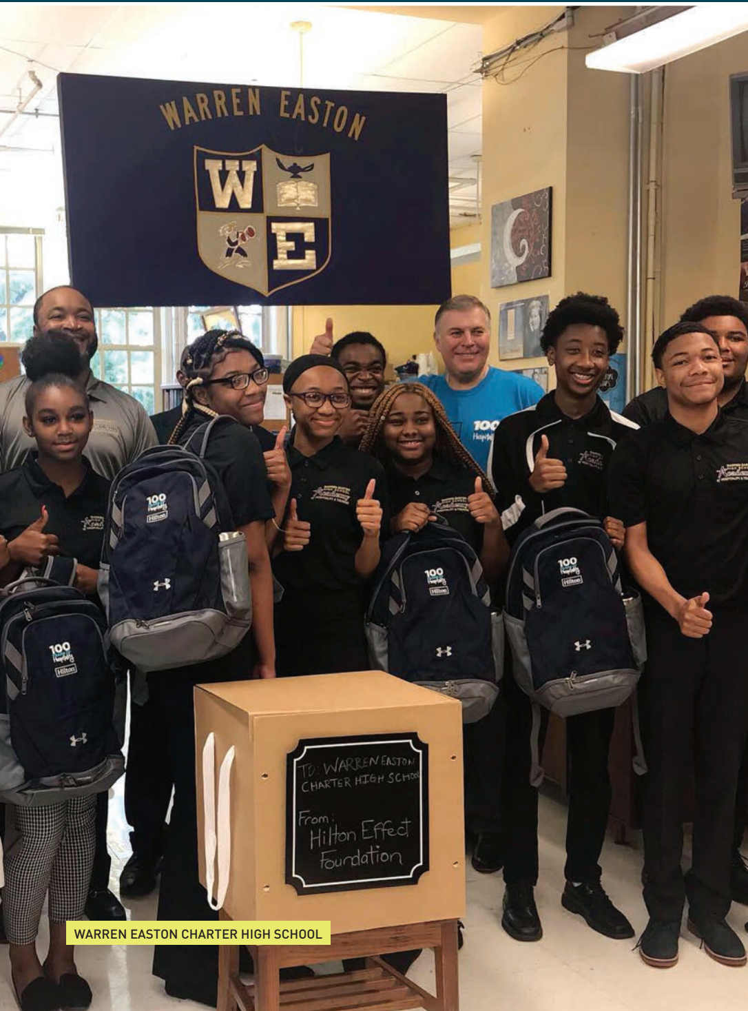
WARREN EASTON CHARTER HIGH SCHOOL

“BECOMING A DISTINGUISHED ACADEMY IS ALL IN THE ROUX!”