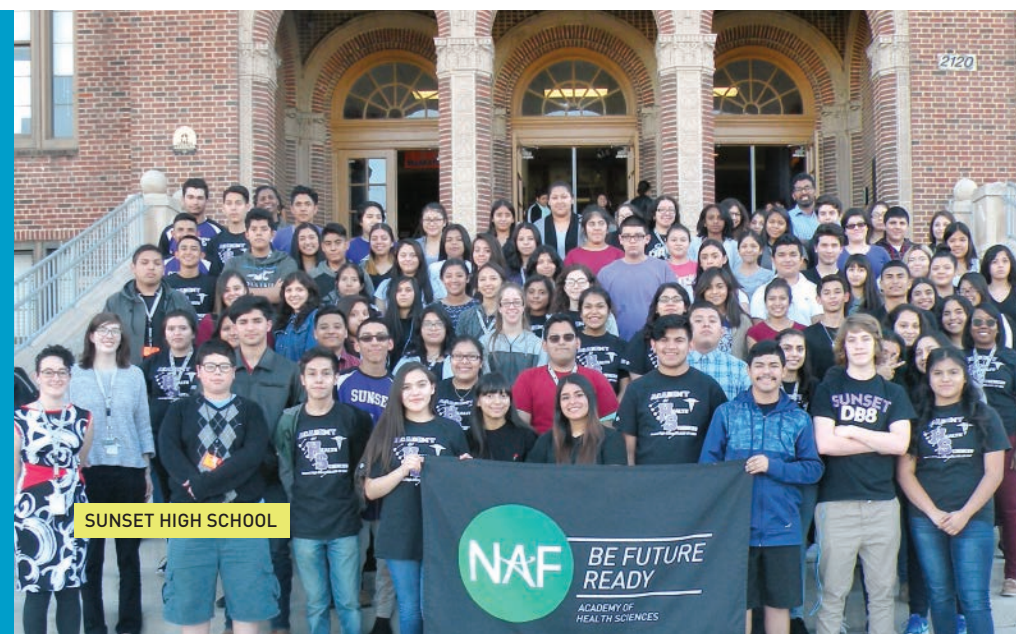
SUNSET HIGH SCHOOL

BEST PRACTICE: We believe the use of data and the development of strong, authentic relationships drives student success and engagement in NAF's Academy of Engineering at H.D. Woodson. We rely on frequent communication with students and families to share successes, as well as areas for growth, in an effort to prepare our scholars for future opportunities to grow and expand their personal and professional knowledge.