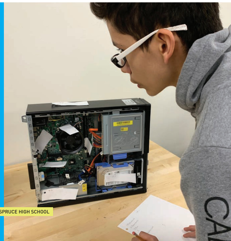
H. GRADY SPRUCE HIGH SCHOOL

BEST PRACTICE: Students receive training for research papers and are prepared to complete college applications and supplementary materials.