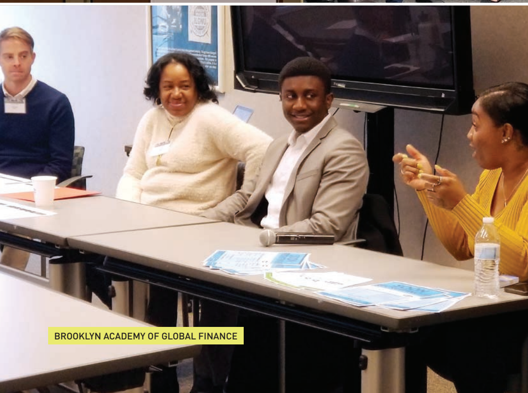
BROOKLYN ACADEMY OF GLOBAL FINANCE