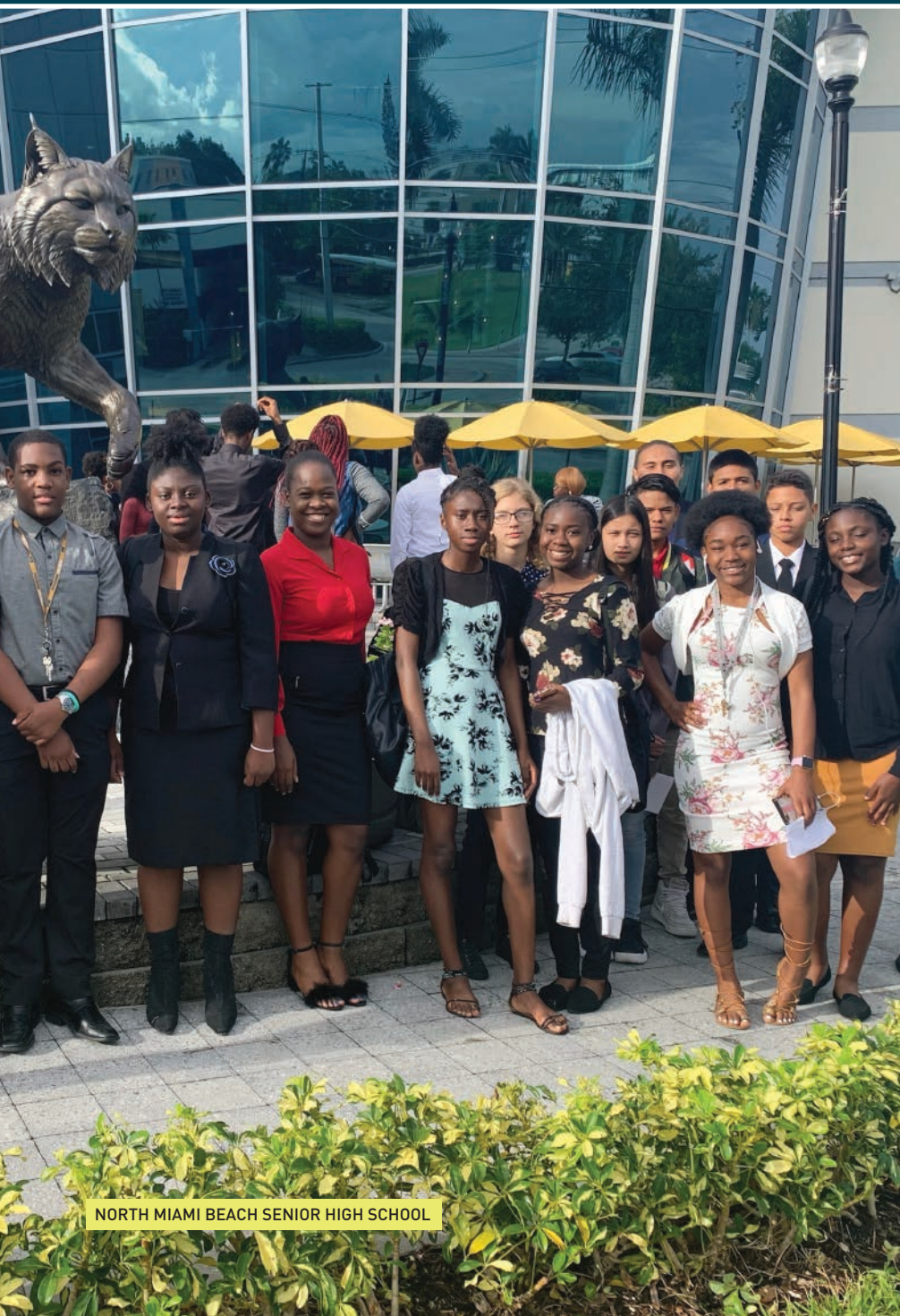
NORTH MIAMI BEACH SENIOR HIGH SCHOOL