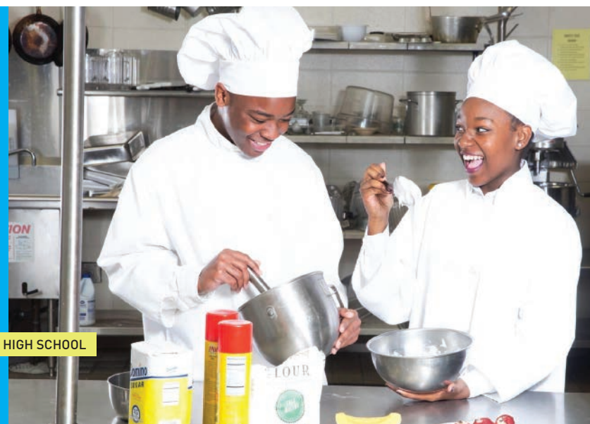
WENONAH HIGH SCHOOL

We were proud to be recognized for our efforts and were selected as the 2020 Sanford I. Weill Academy of Excellence Award Winner!