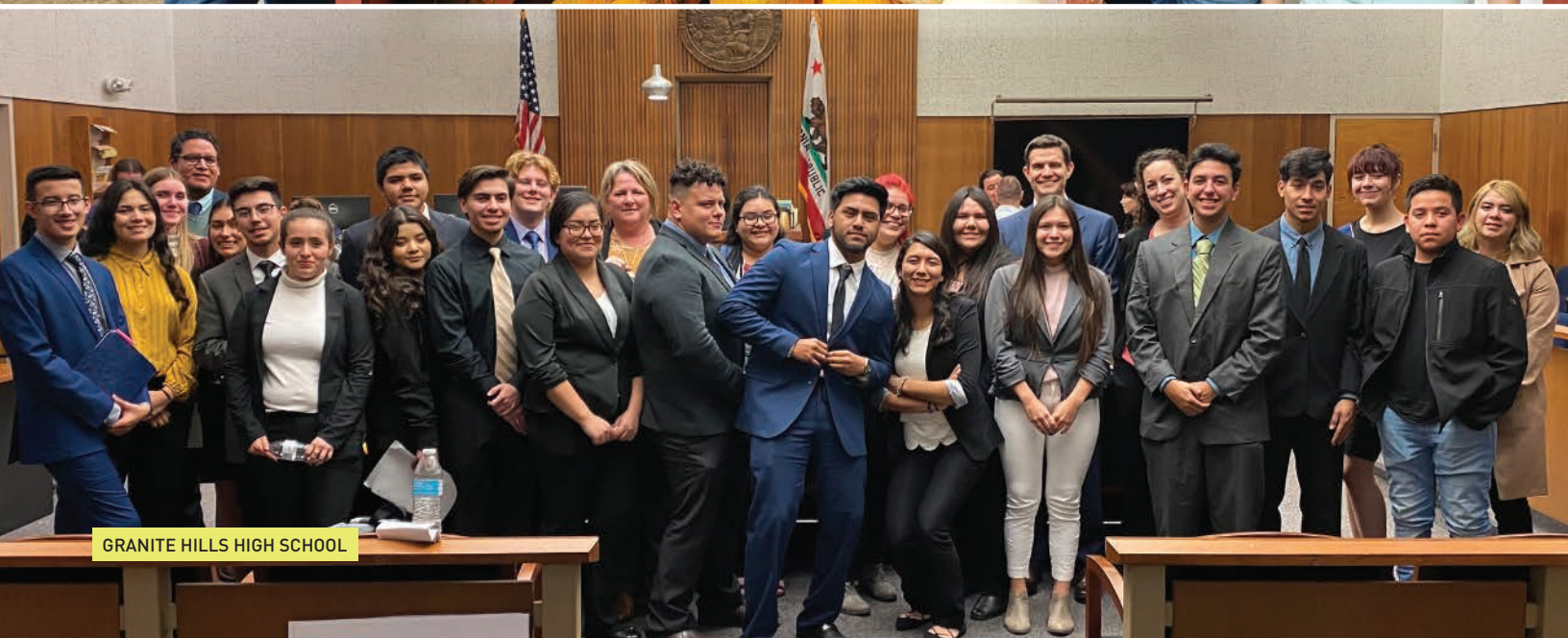
GRANITE HILLS HIGH SCHOOL