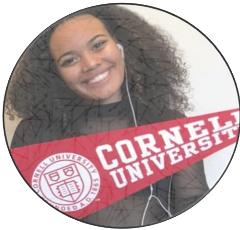
College & Career Readiness

To learn more about NAF's work in areas, please contact our communications department to be connected with a spokesperson.