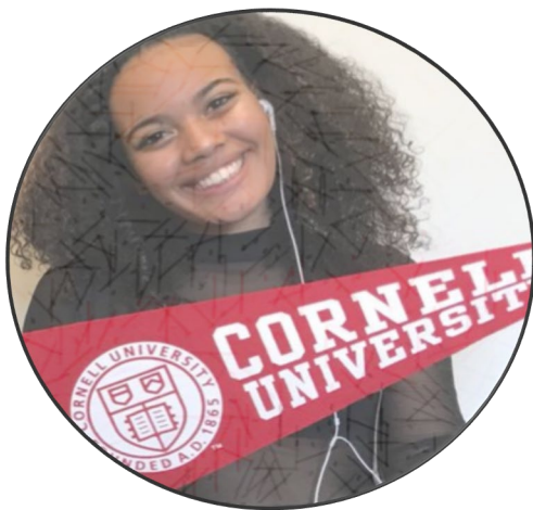
College & Career Readiness

To learn more about NAF's work in areas, please contact our communications department to be connected with a spokesperson.