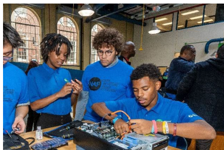
Outcomes-Driven Work-Based Learning